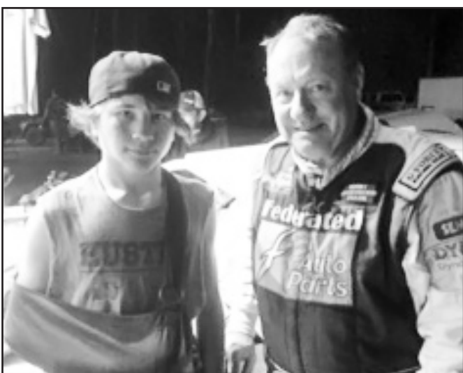
Kenny Schrader (right) at Tri-County.